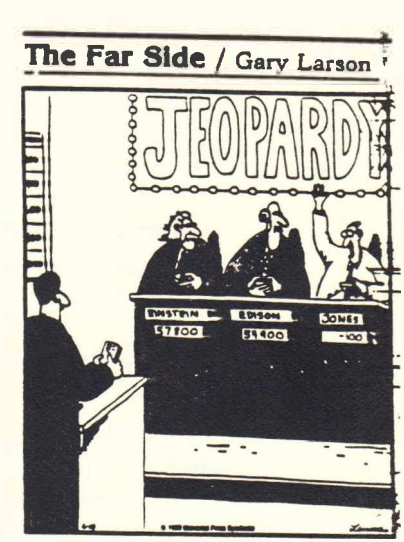
'Excuse me . . . I know the game's aimost over, but just for the record, I don't think my buzzer was working properly.'

We were told that just getting on was an accomplishment. They said they test 15,000 people a year and only 425 get on, so even if we did badly on the show, we should be proud. Once you're on, it's just luck which categories you get, whom you play against, and how quickly you acclimate to the buzzer (my nemesis).